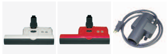
ET-2 White #9259AM