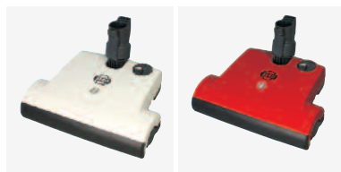
ET-H White #9256AM

The SEBO ET-H Power Head (11 ¾ inches wide, 11 ½-inch cleaning path) – This model’s T-shaped head offers two-sided edge cleaning and variable brush pressure adjustment for optimal cleaning of carpets and hard floors. However, its brush roller cannot be manually switched off. The ET-H’s maneuverable steering mechanism helps to easily clean around