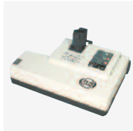
ET-C White #9254AM

The ET-C has a brush roller with a replaceable brush strip. This is part of its heavy-duty sealed brushing mechanism, but the brush cannot be manually switched off. The L-shaped head helps maneuverability around furniture. However, its steering mechanism does not rotate left or right. The ET-C features an orange brush obstruction warning light along with automatic shut off. The warning light, located next to the green “on light,” remains illuminated during use when brush agitation is not cleaning optimally, i.e., its brush strip should be replaced because of wear. It has “floating style” brush height adjustment, and the extension side of the head cleans to the edge.