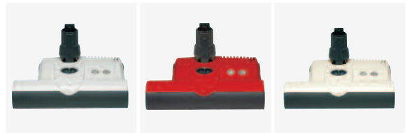
ET-1 White #9258AM

The SEBO ET-1 (12 inches wide, 10 ½-inch cleaning path) and ET-2 (14 ¾ inches wide, 13-inch cleaning path) – This model comes in two widths and has four-level manual brush height adjustment. It aggressively cleans carpets, but the brush roller may be switched off, by pressing the green illuminated on/off button, to clean delicate rugs and hard floors. Its amazing steering ability provides maneuverability around furniture, and the L-shaped head makes edge cleaning easy. It also has easy brush roller removal, a convenient clog removal door, and an orange warning light with automatic shut off for brush roller obstructions. Its warning light also remains illuminated during use when brush height is set too high for optimal cleaning or when the brush should be replaced because of wear. The extension side of the head cleans to the edge.