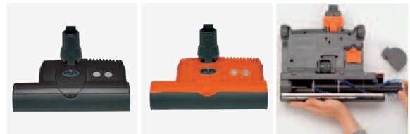
ET-1 Onyx #9951AM